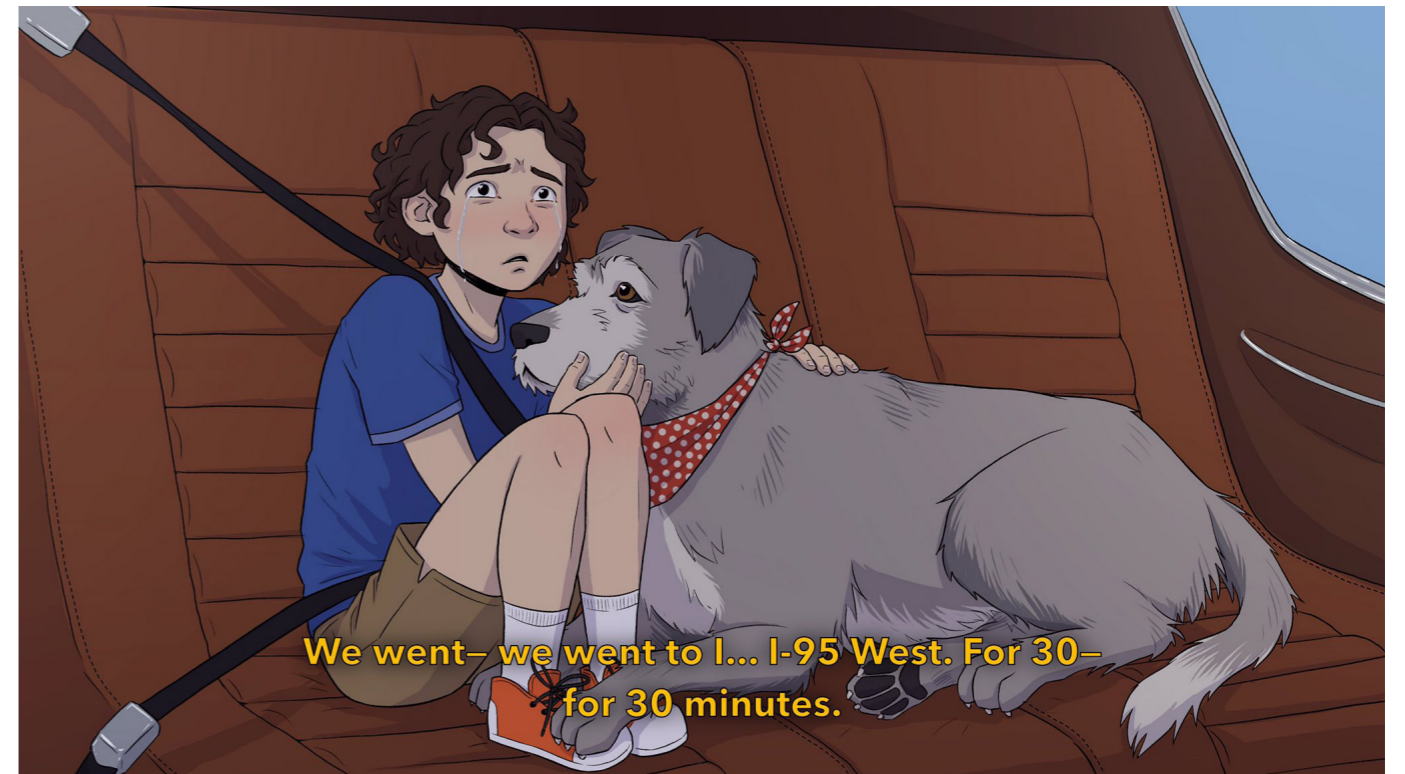
Artist: @Megolas_Art (Twitter)