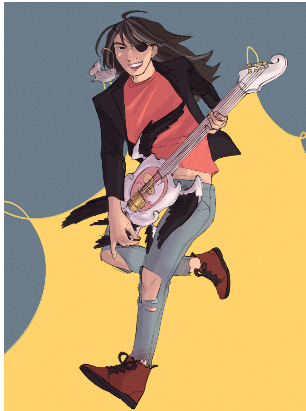
Artist: @fishmeal_ ( Twitter )