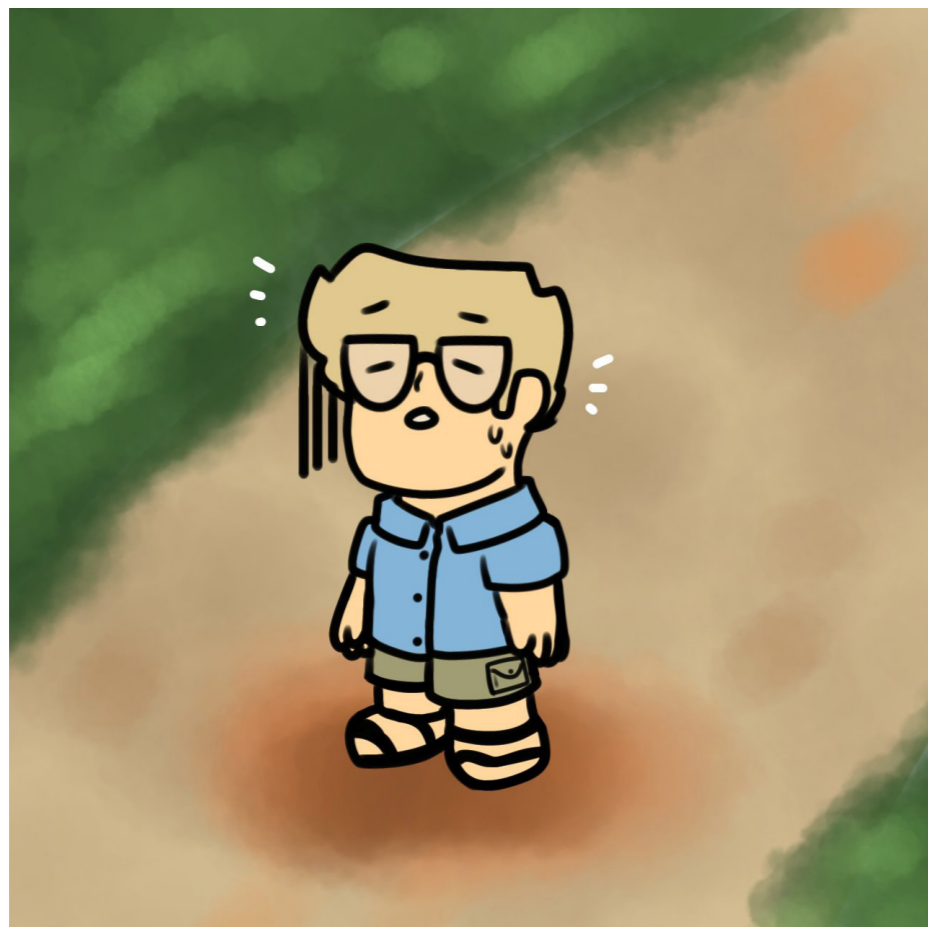
Artist: @PensivePants (Twitter)