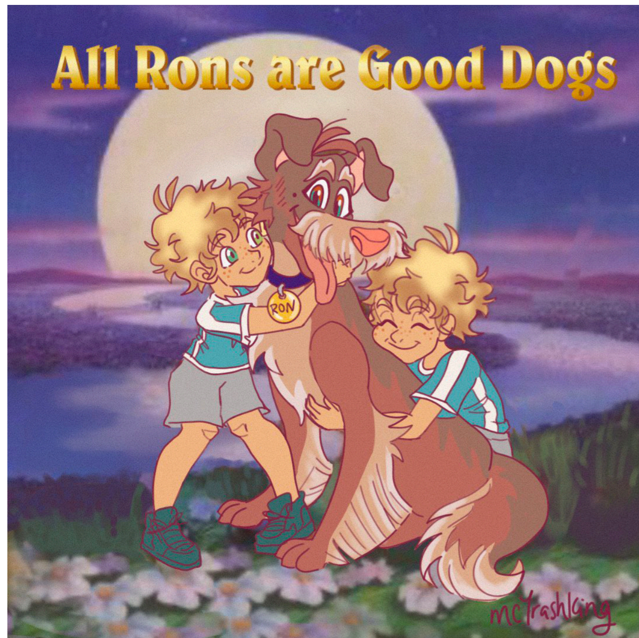
Artist: @mctrashkingart ( Twitter )