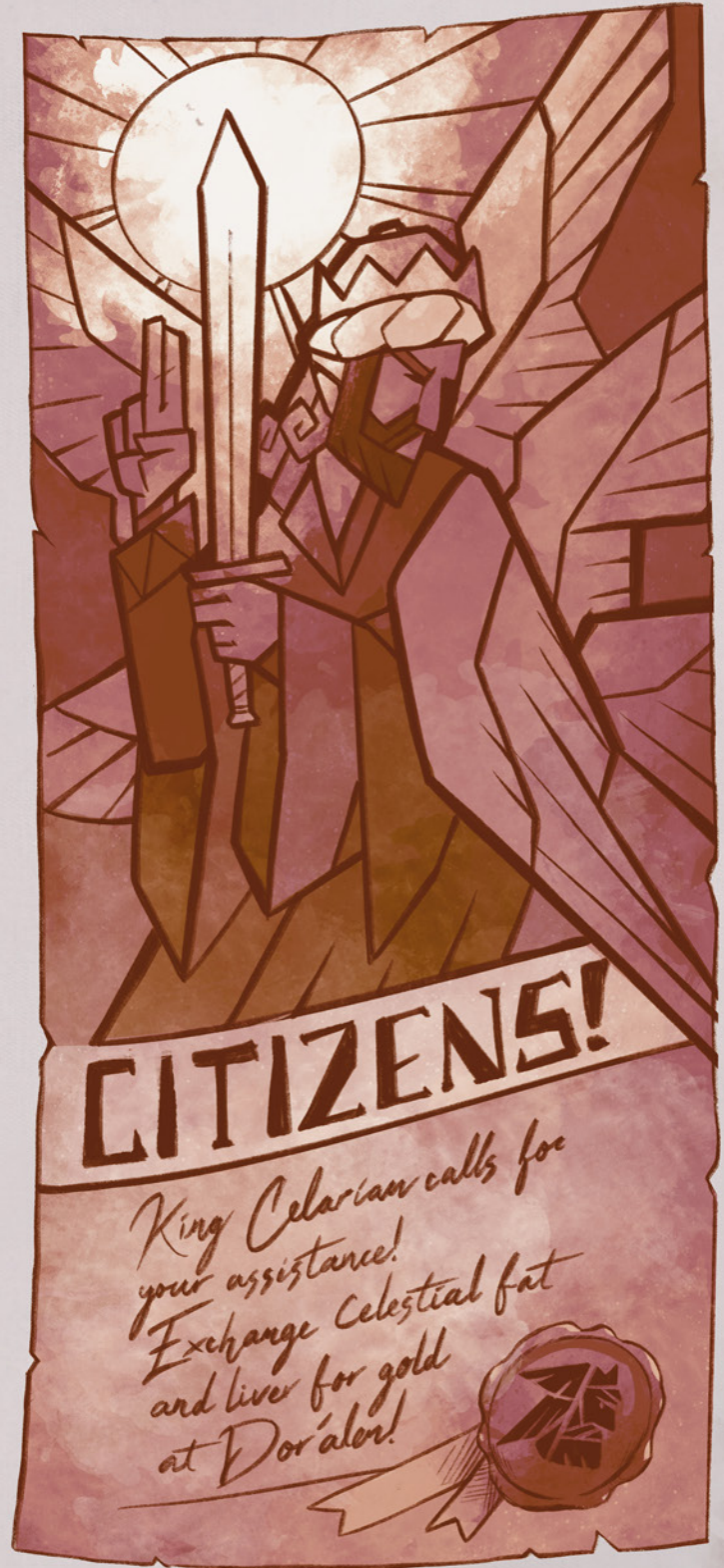
HANDOUT 1. CELARIAN'S CALL

Give the players a copy of Handout 5.1 Celarian's Call. A character that succeeds on a DC 11 Wisdom (Survival or cook's utensils) check recognizes that the combination of celestial fat and liver can be cooked to make a variant of the magical meal gobbois gras . A successful DC 13 Intelligence (Religion or cook's utensils) check recalls that these ingredients confer the ability to damage celestials and absorb radiant damage to any imbiber. A DC 15 Wisdom (Perception) check notices that the king's blade appears to be covered in radiant energy.